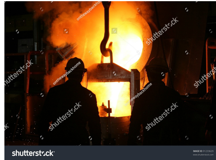
MP/REFINING/https - www.shutterstock.com - image-photo - smelting-metal-liquid-iron-foundry-91233629.

“He is like a refiner’s fire and like fullers’ soap” (Malachi 3:2b)