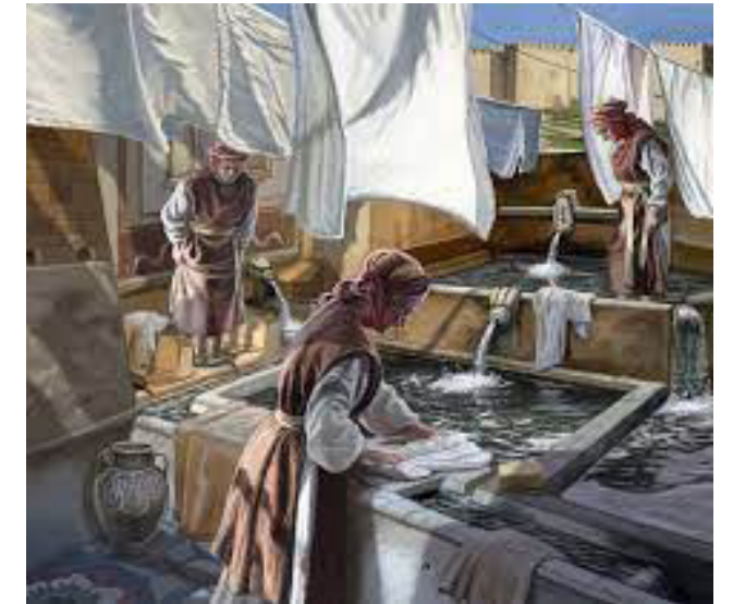
WOMAN WITH FULLERS’ SOAP

“But who can endure the day of His coming? And who can stand when He appears? For He is like a refiner’s fire and like fullers’ soap” (Malachi 3:2).